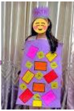
Maths fancy dress