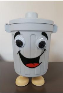
10 th January 2025 5 Seacole